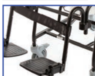
PL13581 Left Gooseneck Leg Rest