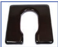
P61123 20"Wx20"D Ensolite® 1" waterfall foam Front/Rear Open Seat A-4.5"xB-7.75" opening