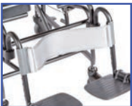
P61081 Bodypoint® Calf Strap