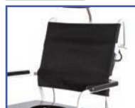
P61139 16"W Adjustable Sling Back