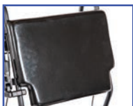
P11110 16"W Solid Back