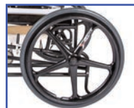
P13862 24" Wheels (pair)