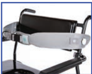
P11113 Bodypoint® Belt w/Quick Release Knobs