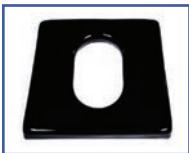
P60886 20"Wx20"D Ensolite® 1.5" foam Race Track Oval Seat A-7.75"xB-12.75" opening