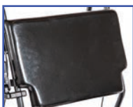
P11109 22"W Solid Back