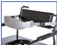
P11112 Bodypoint® XL Trunk Belt