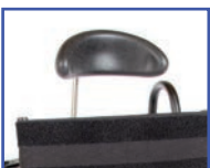
P13621 Head Support Large