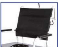
P60878 20"W Adjustable Sling Back