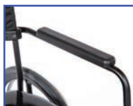
P13611 Left Hand Armrest with Pad