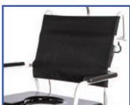
P61140 22"W Adjustable Sling Back