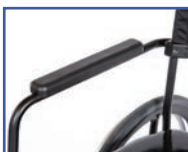
P13612 Right Hand Armrest with Pad