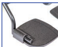
P13892 Right Oversized Aluminum Foot Plate