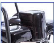
P61006 Abductor/Deflector Small