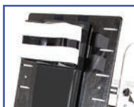
P11105 Head Support Small Foam (only available for P11106)