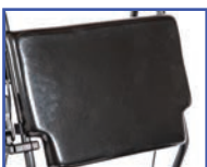
P11108 20"W Solid Back