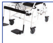
P60800-2 5" Dual Locking Casters (pair)