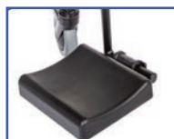
PL11101 Left Padded Foot Plate