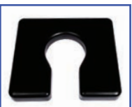
P61038 20"Wx18"D Comfortuff 1.5" waterfall foam Front Open Seat A-5"xB-8" opening