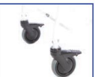
P60800-2 5" Dual Locking Casters (pair)