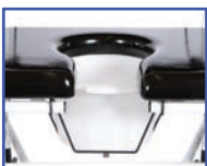
P13831 Pan/Hanger for Ring and Contoured Seats