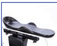
P13613 Left Hand Armrest with Arm Trough