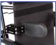
PR13574 Right Hand Swing-Away Adjustable Lateral