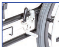
P60532 Wheel Locks (pair)