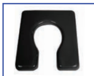
P61124 16"Wx18"D Ensolite® 1" foam Front/Rear Open Seat A-4.75"xB-7.75" opening