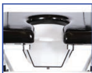
P13832 Pan/Hanger for Front/Rear, & Race Track Oval Seats