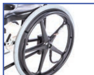
P13865 24" Flat Free Street Tread Wheels (pair)