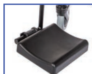
PR11101 Right Padded Foot Plate