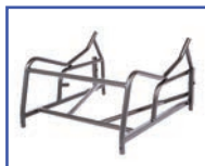
P13637 20"Wx18"D Stainless Steel Frame