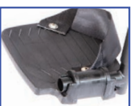
PL11100 Left Foot Plate with Heel Loop