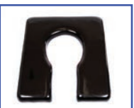
P61121 18"Wx20"D Ensolite® 1" foam Front Open Seat A-4.5"xB-7.5" opening