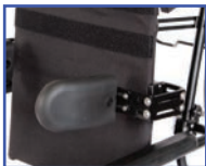
PL13574 Left Hand Swing-Away Adjustable Lateral