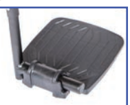
PR11099 Right Foot Plate