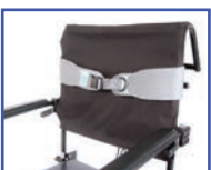
P11093 Bodypoint® Trunk Belt