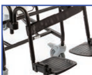
PR13581 Right Gooseneck Leg Rest