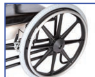
P13864 24" Pneumatic Street Tread Wheels (pair)