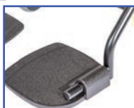
P13891 Left Oversized Aluminum Foot Plate