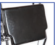
P11107 18"W Solid Back