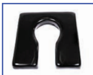
P60802 18"Wx18"D Ensolite® 1.25" foam Front Open Ring Seat A-4.5"xB-7.75" opening