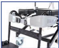
P11114 Bodypoint® Knee Belt