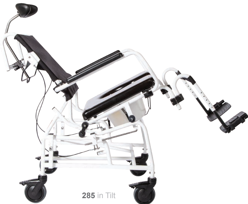
285 in Tilt