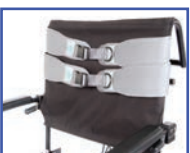
P11102 Bodypoint® Trunk Belt (pair)