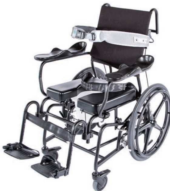
PKG207 Package #5 - 18"W x 18"D