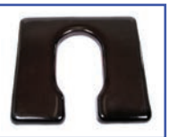
P61126 22"Wx20"D Ensolite® 1" waterfall foam Front/Rear Open Seat A-4.5"xB-7.75" opening