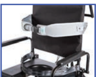
P11116 Bodypoint® Trunk Belt & Waist Belt