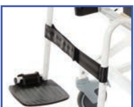
P60879 Calf Strap