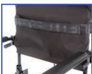
PT60910 Trunk Belt (for 16"W and 18"W frames only, 48" circumference with 12" overlap)