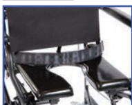
PW60884 Waist Belt (62", 64", 66", or 68" circumference with 12" overlap)