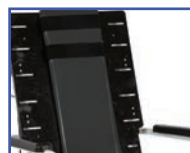
P11106 16"W Solid Back Full Length w/ Center Pad