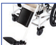
P13582 Left Elevating Leg Rest