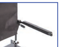
P13615 Left Hand Height-Adjustable Armrest