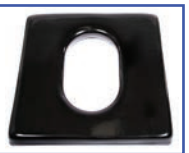
P60887 22"Wx20"D Ensolite® 1.5" foam Race Track Oval Seat A-7.75"xB-12.75" opening