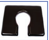
P60905 22"Wx18"D Ensolite® 1" foam Front/Rear Open Seat A-4.5"xB-7.75" opening