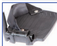
PR1100 Right Foot Plate with Heel Loop