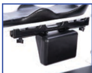
PR13618 Right Hand Arm-Mounted Hip Guide