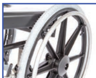
P13857 24" PVC Handrims (replaces standard handrims, pair)