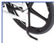
P13688 Bolted Axles with Tipping Levers (pair)