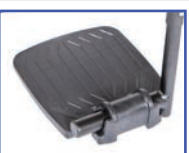
PL11099 Left Foot Plate