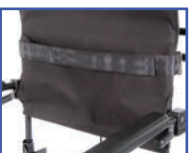
PT61180 Trunk Belt (for 20"W and 22"W frames only, 58" circumference with 12" overlap)