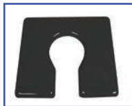
P60903 20"Wx18"D Ensolite® 1" foam Front/Rear Open Seat A-4.5"xB-7.75" opening