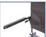
P13616 Right Hand Height-Adjustable Armrest