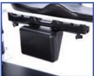
PL13618 Left Hand Arm-Mounted Hip Guide