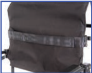
PT60884 Trunk Belt (62", 64", 66", or 68" circumference with 12" overlap)