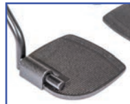
P13892 Right Oversized Aluminum Foot Plate