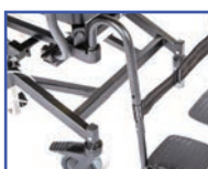
PR13725 Right Leg Rest