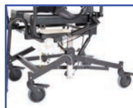
P60800-4 5" Dual Locking Casters (2 pair)