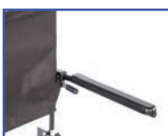
P13615 Left Hand Height-Adjustable Arms