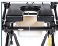
P13835 18"Wx20"D Pan/Hanger