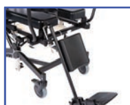
P13572 Right Elevating Leg Rest