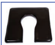
P61126 22"Wx22"D Ensolite® 1" waterfall foam Front/Rear Open Seat A-5"xB-8" opening