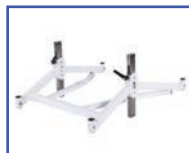
P13766 20"Wx20"D Stainless Steel Frame