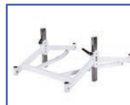
P13768 22"Wx20"D Stainless Steel Frame