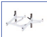
P13762 16"Wx18"D Stainless Steel Frame