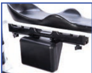
PL13618 Left Hand Arm-Mounted Hip Guide