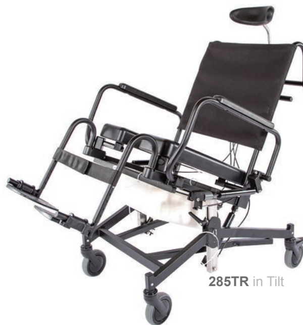
285TR in Tilt