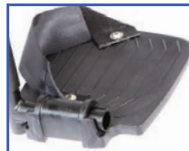
PR11100 Right Foot Plate with Heel Loop