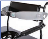
P11113 Bodypoint® Belt w/Quick Release Knobs