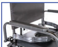
P13736 20"D Right Hand Armrest with Pad