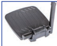
PL11099 Left Foot Plate