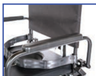
P13729 18"D Left Hand Armrest with Pad