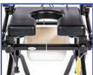
P13837 20"Wx20"D Pan/Hanger