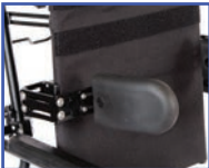
PR13574 Right Hand Swing-Away Adjustable Lateral