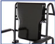
P13748 18"W Solid Back