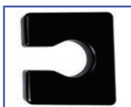
PP61038 18"Wx20"D Comfortuff 1.5" waterfall foam Side Open Seat A-5"xB-8" opening