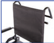
P13750 20"W Sling Back