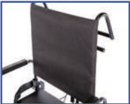
P13745 16"W Sling Back