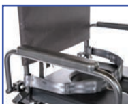
P13730 18"D Right Hand Armrest with Pad