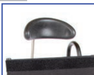
P13758 Head Support XL