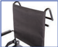
P13747 18"W Sling Back