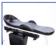
P13737 20"D Left Hand Armrest with Arm Trough