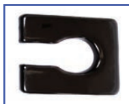
PP61121 20"Wx18"D Ensolite® 1" foam Side Open Seat A-4.5"xB-7.5" opening