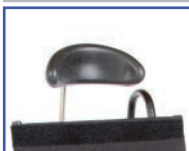
P13621 Head Support Large