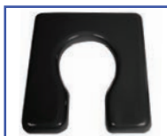
P61124 16"Wx18"D Ensolite® 1" foam Front Open Seat A-4.75"xB-7.75" opening