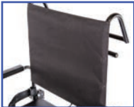
P13752 22"W Sling Back