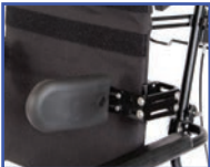
PL13574 Left Hand Swing-Away Adjustable Lateral