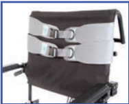
P11102 Bodypoint® Trunk Belt (pair)