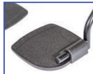
P13891 Left Oversized Aluminum Foot Plate