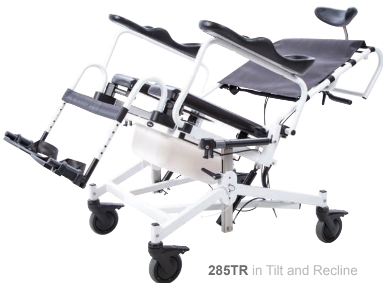
285TR in Tilt and Recline