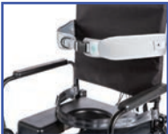
P11116 Bodypoint® Trunk Belt & Waist Belt