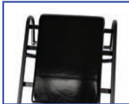
P13751 20"W Solid Back