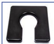
P60993* 18"Wx18"D Comfortuff 1.5" waterfall foam Front/Rear Open Seat A-5"xB-8" opening