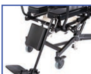
P13571 Left Elevating Leg Rest