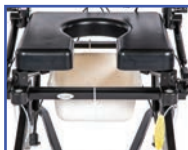
P13836 20"Wx18"D Pan/Hanger