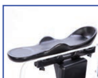
P13738 20"D Right Hand Armrest with Arm Trough