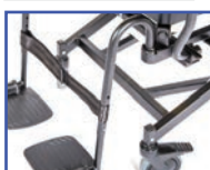
PL13725 Left Leg Rest