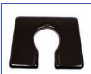
P60905 22"Wx18"D Ensolite® 1" foam Front/Rear Open Seat A-4.5"xB-7.75" opening