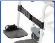
P60879 Calf Strap