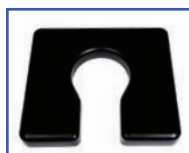
P61038 20"Wx18"D Comfortuff 1.5" waterfall foam Front Open Seat A-5"xB-8" opening