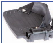
PL11100 Left Foot Plate with Heel Loop