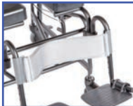
P61081 Bodypoint® Calf Strap