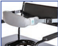
P11112 Bodypoint® XL Trunk Belt