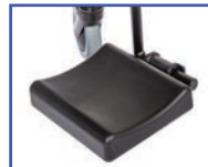
PL11101 Left Padded Foot Plate