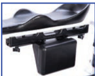
PR13618 Right Hand Arm-Mounted Hip Guide