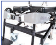
P11114 Bodypoint® Knee Belt