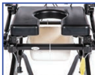
P13833 16"Wx18"D Pan/Hanger