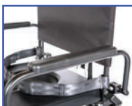
P13735 20"D Left Hand Armrest with Pad