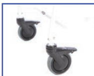
P13770 5" Casters (pair) and 5" Dual Locking Casters (pair)