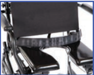
PW60884 Waist Belt (62", 64", 66", or 68" circumference with 12" overlap)