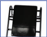
P13746 16"W Solid Back