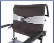
P11093 Bodypoint® Trunk Belt