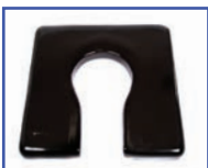
P61123* 20"Wx20"D Ensolite® 1" waterfall foam Front/Rear Open Seat A-5"xB-8" opening