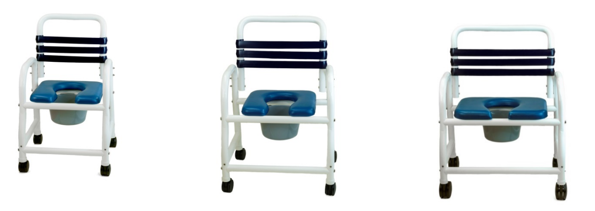
DNE – 118-3TWL 310 LBS. CAP.

Seamless Infection Control Patent Pending Design-No Fittings Exclusively by Mor-Medical designed for efficient infection control. Structural frame held in place with high tensile strength stainless steel bolts. Patent Pending US62/782,082