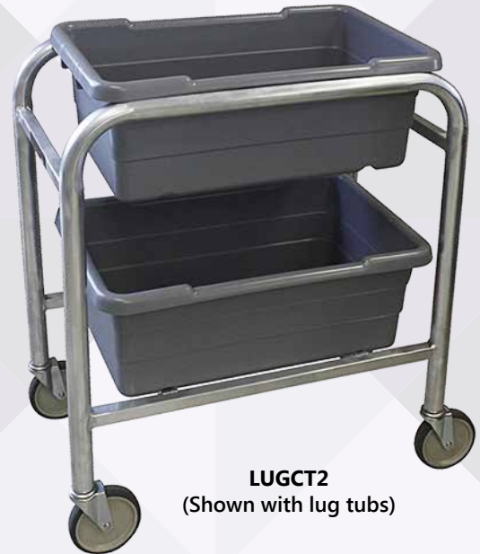
LUGCT2 (Shown with lug tubs)