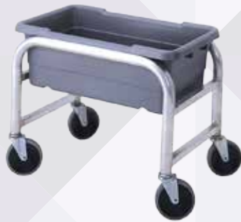
LUGCT1 (Shown with lug tubs)