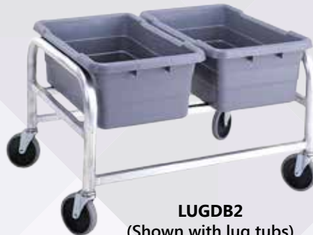
LUGDB2 (Shown with lug tubs)