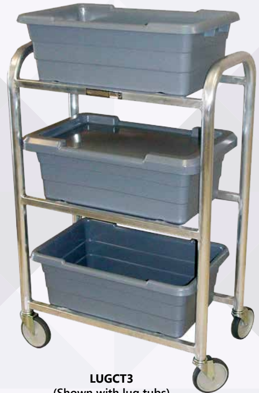
LUGCT3 (Shown with lug tubs)