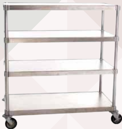
N244860-4-CHL2-B4 (shown with optional bumpers)