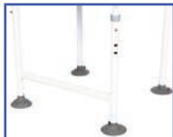
P13643 Legs w/Suction Tips (height seat range from floor to bottom frame-16"-19")