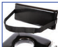
PT60909 Trunk Belt (54" circumference with 12" overlap)