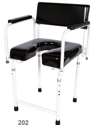
202 with Support Options