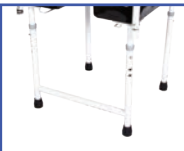
P13642 Legs w/Crutch Tips (height seat range from floor to bottom frame-16"-19")