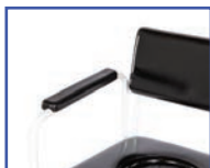
PR13291 Right Hand Armrest with Pad