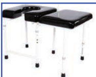
P13294 B-O Transfer Bench