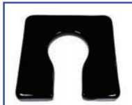
P60850* 18"Wx18"D Ensolite® 1" waterfall foam Front/Rear Open Seat A-5"xB-8" opening