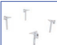
P13641 18"Wx18"D White Stainless Steel Frame