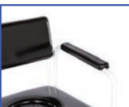
PL13291 Left Hand Armrest with Pad