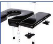
P13352 Short Transfer Bench