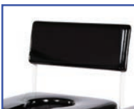
P13295 Back Tubes w/Solid Back Pad (13.5"H)