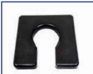
P60993* 18"Wx18"D Comfortuff 1.5" waterfall foam Front/Rear Open Seat A-5"xB-8" opening