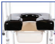
P13876 18"Wx18"D Pan/Hanger