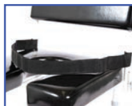
PW60884 Waist Belt (64" circumference with 12" overlap)