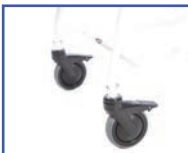
P60800-2 5" Dual Locking Casters (pair)