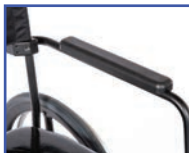
P13278 18"D Left Hand Armrest with Pad