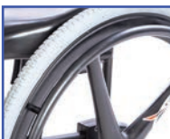
P13855 20" PVC Handrims (replaces standard handrims, pair)