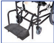
P13667 18"W 1-pc. Foot Plate/Leg Rest