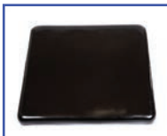
PP61122 20"Wx18"D Ensolite® 1" foam Solid Seat