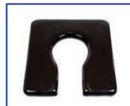
P60701* 18"Wx18"D Ensolite® 1" foam Front/Rear Open Seat A-4.55"xB-7.75" opening