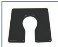
P60903 18"Wx18"D Ensolite® 1" foam Front/Rear Open Seat A-4.5"xB-7.75" opening