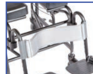
P61081 Bodypoint® Calf Strap (only available with 18" back)