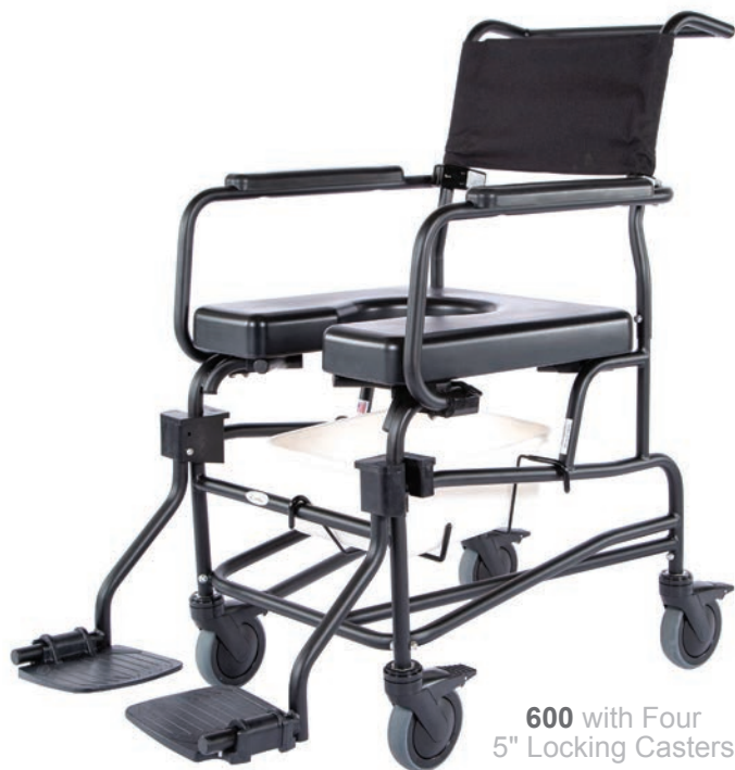
600 with Four 5" Locking Casters