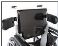
PL13574 Left Hand Swing-Away Adjustable Lateral