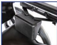
PL13618 Left Hand Arm-Mounted Hip Guide