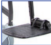
PL11099 Left Foot Plate