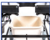
P13840 18"Wx18"D Pan/Hanger