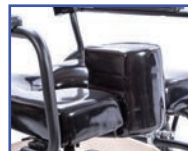
P61006 Abductor/Deflector Large