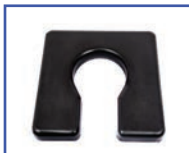
P60993* 18"Wx18"D Comfortuff 1.5" waterfall foam Front/Rear Open Seat A-5"xB-8" opening