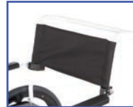
P13651 18"W Sling Back with Stroller Handles