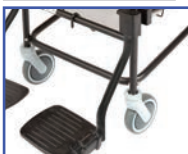
P13665 Left Leg Rest