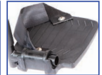
PR11100 Right Foot Plate with Heel Loop