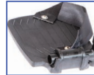
PL11100 Left Foot Plate with Heel Loop