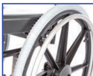
P13857 24" PVC Handrims (replaces standard handrims, pair)