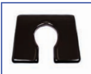
P60905 22"Wx18"D Ensolite® 1" foam Front/Rear Open Seat A-4.5"xB-7.75" opening