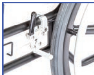
P60532 Wheel Locks (pair)