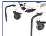
P13670 Front Anti-Tippers