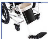
P13583 Right Elevating Leg Rest