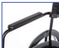
P13664 20"D Right Hand Armrest with Pad