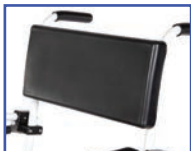
P13659 20"W Solid Back