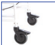
P60800-2 5" Dual Locking Casters (pair)