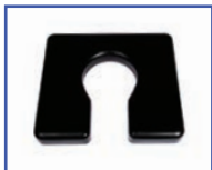
P61038 20"Wx18"D Comfortuff 1.5" waterfall foam Front Open Seat A-5"xB-8" opening