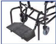
P13668 20"W 1-pc. Foot Plate/Leg Rest