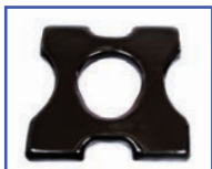
P60675 18"Wx18"D Ensolite® 1" foam Cloverleaf Seat A-7.5"xB-9" oval opening