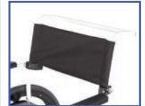
P13658 20"W Sling Back with Stroller Handles