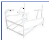
P13678 22"Wx18"D Stainless Steel Frame