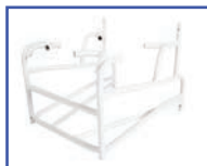
P13677 20"Wx18"D Stainless Steel Frame