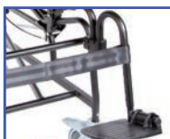
PL13581 Left Gooseneck Leg Rest