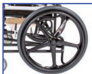
P13862 24" Wheels (pair)