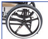
P13860 20" Wheels (pair)