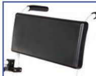
P13662 22"W Solid Back