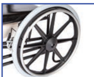
P13864 24" Pneumatic Street Tread Wheels (pair)