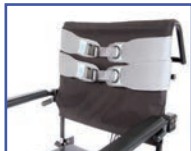
P11102 Bodypoint® Trunk Belt (pair)