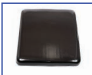
P61086 18"Wx18"D Ensolite® 2" foam Solid Seat