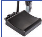
PR11101 Right Padded Foot Plate