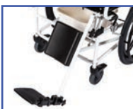
P13582 Left Elevating Leg Rest