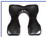
P60974 18"Wx18"D Comfortuff sloped foam Front Open Seat A-4"xB-6.5" opening