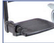
PR11099 Right Foot Plate