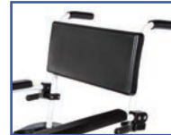
P13652 18"W Solid Back