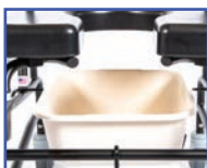
P13842 20"Wx18"D Pan/Hanger