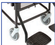
P13666 Right Leg Rest