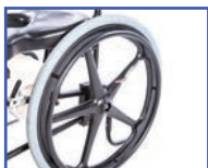
P13865 24" Flat Free Street Tread Wheels (pair)