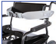
P11116 Bodypoint® Trunk Belt & Waist Belt