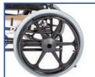
P13863 20" Pneumatic Street Tread Wheels (pair)