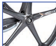
P13650 Quick Release Axles with Wheel Mounts and Tipping Levers (pair)