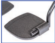
P13891 Left Oversized Aluminum Foot Plate