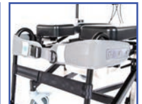
P11114 Bodypoint® Knee Belt