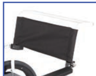
P13661 22"W Sling Back with Stroller Handles