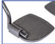
P13892 Right Oversized Aluminum Foot Plate