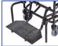
P13669 22"W 1-pc. Foot Plate/Leg Rest