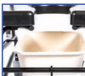
P13843 22"Wx18"D Pan/Hanger