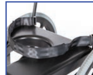
PW60884 Waist Belt (for 20"W and 22"W frames only, 66" and 68" circumference with 12" overlap)