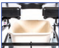
P13841 18"Wx20"D Pan/Hanger