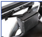
PR13618 Right Hand Arm-Mounted Hip Guide