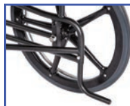
P13649 Bolted Axles with Wheel Mounts and Tipping Levers (pair)