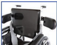
PR13574 Right Hand Swing-Away Adjustable Lateral