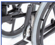
P13135 Wheel Locks with Extended Handle (pair)