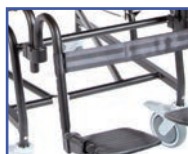
PR13581 Right Gooseneck Leg Rest