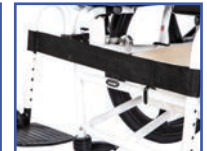
P60879 Calf Strap