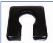
P60913* 18"Wx18"D Ensolite® 2" waterfall foam Front/Rear Open Seat A-5.25"xB-8" opening