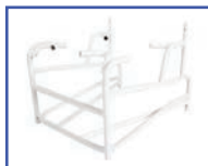
P13675 18"Wx18"D Stainless Steel Frame