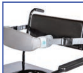
P11112 Bodypoint® XL Trunk Belt