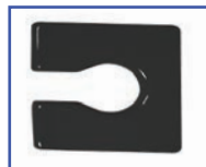
PP60903 18"Wx20"D Ensolite® 1" foam Side Open Seat A-4.5"xB-7.75" opening