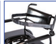
PT60884 Trunk Belt (64", 66" and 68" circumference with 12" overlap)