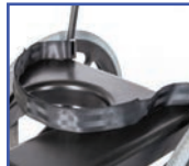
PW60909 Waist Belt (for 18"W frame only, 54" circumference with 12" overlap)