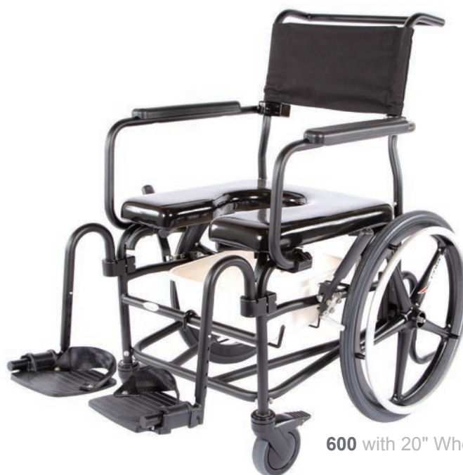
600 with 20" Wheels