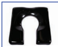
P61058 18"Wx18"D Ensolite® 2" waterfall foam Front Open Contoured Seat A-5.5"xB-8.25" opening