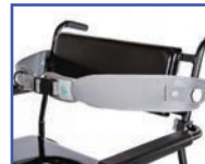
P11113 Bodypoint® Belt w/Quick Release Knobs