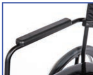
P13277 18"D Right Hand Armrest with Pad