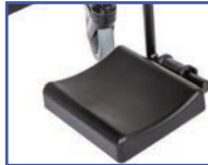
PL11101 Left Padded Foot Plate