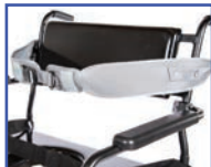
P11093 Bodypoint® Trunk Belt