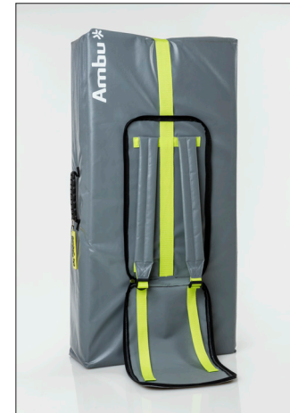
Transport bag (practice mat incl.)

Questions? Contact your Ambu representative at 800-262-8462 or visit www.ambuUSA.com/