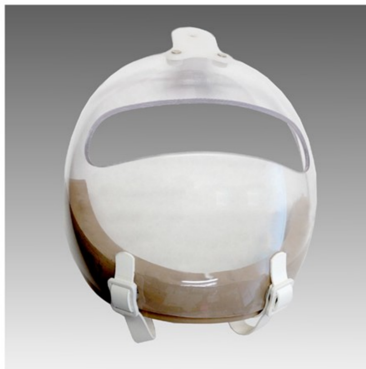
8. Standard eye opening with solid mouth area.