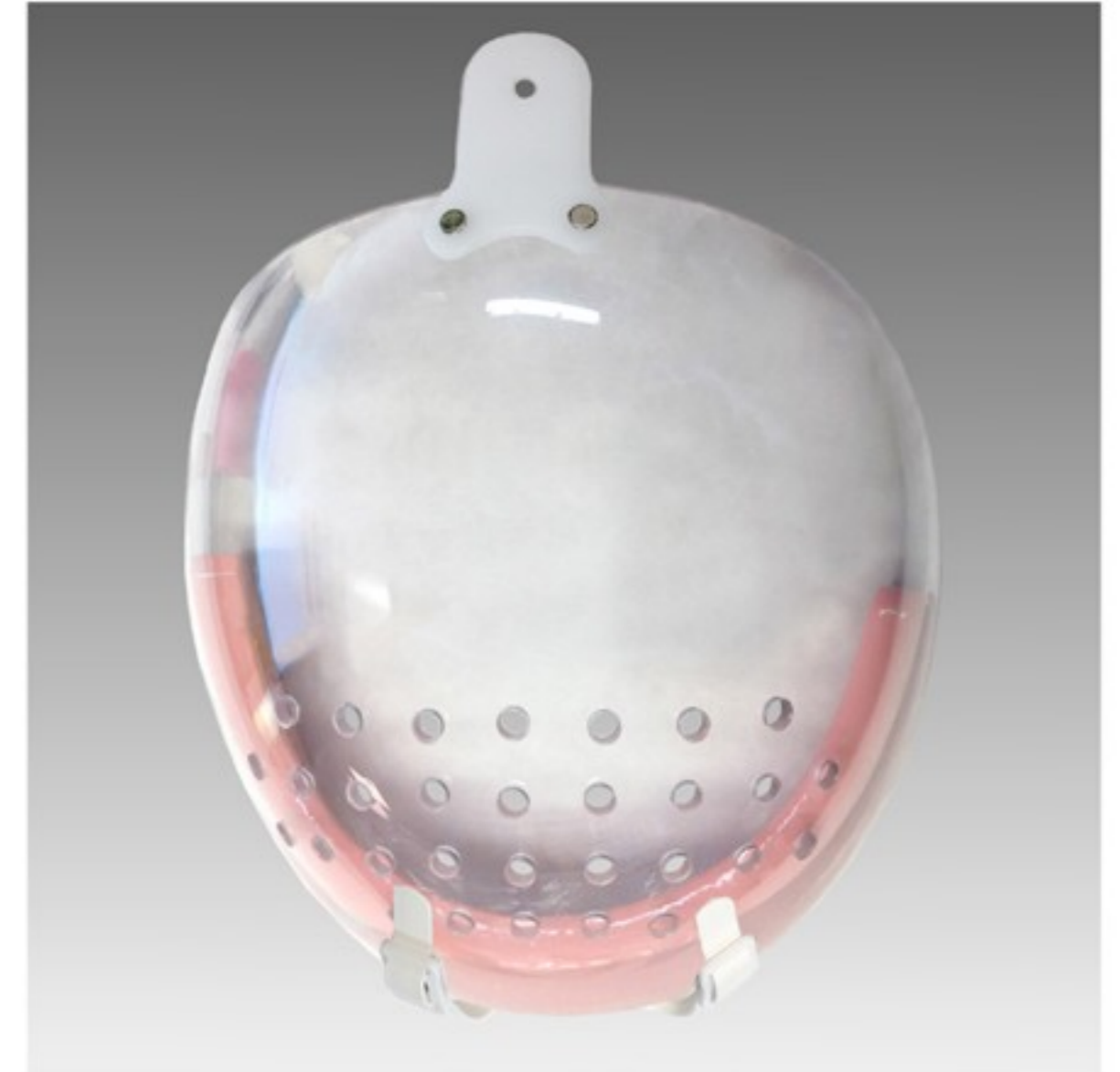
6. Solid eye area with ventilation holes in mouth and nose areas.