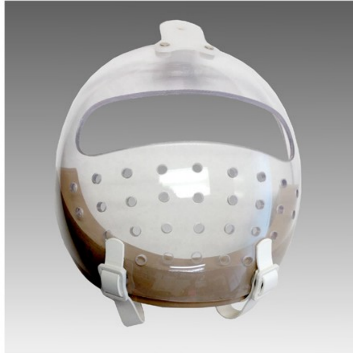
5. Standard eye opening with ventilation holes in mouth and nose areas.