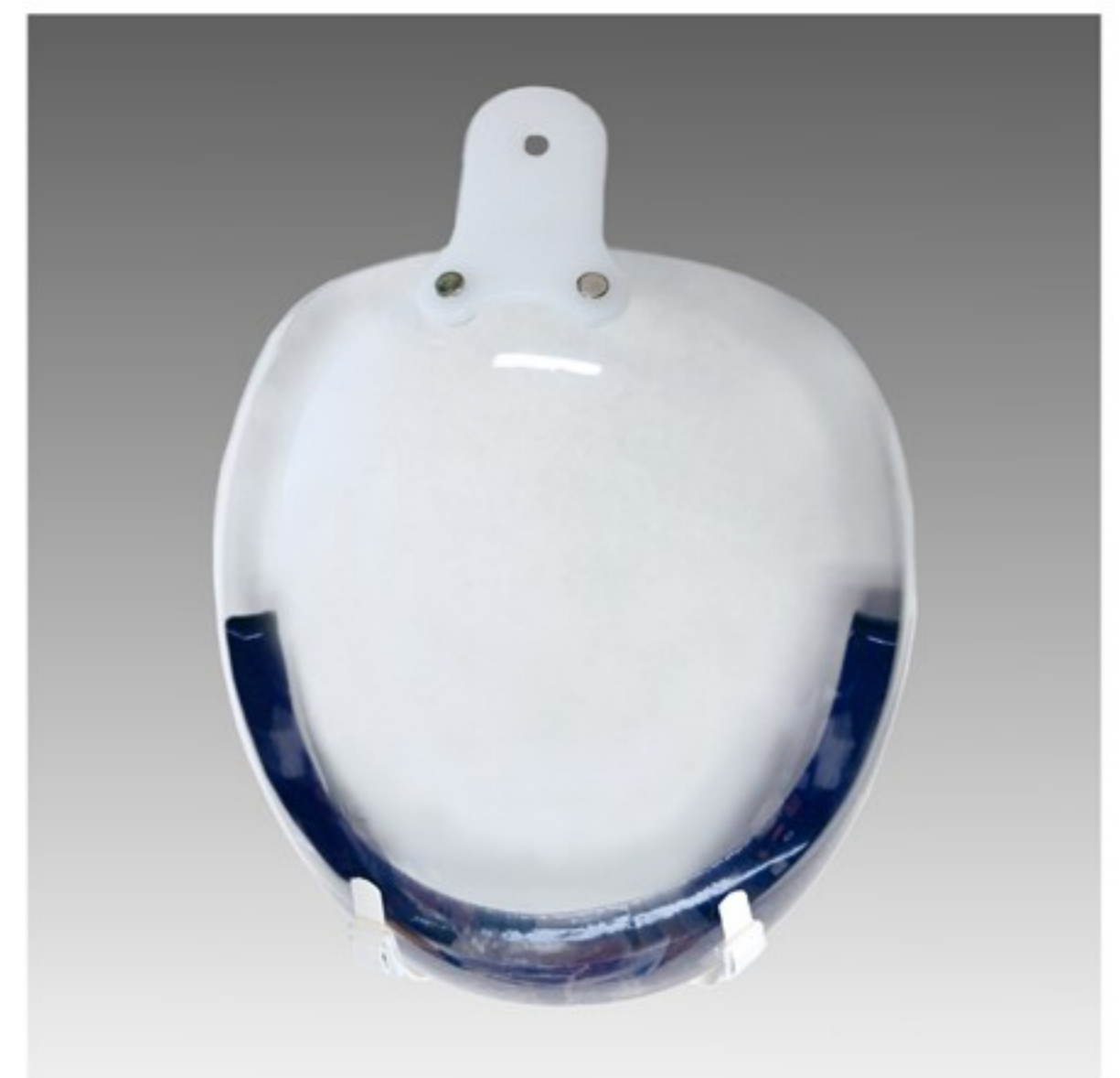
9. Solid Face Guard without any openings.

***NOT RECOMMENDED as the Face Guard will fog up with respiration***