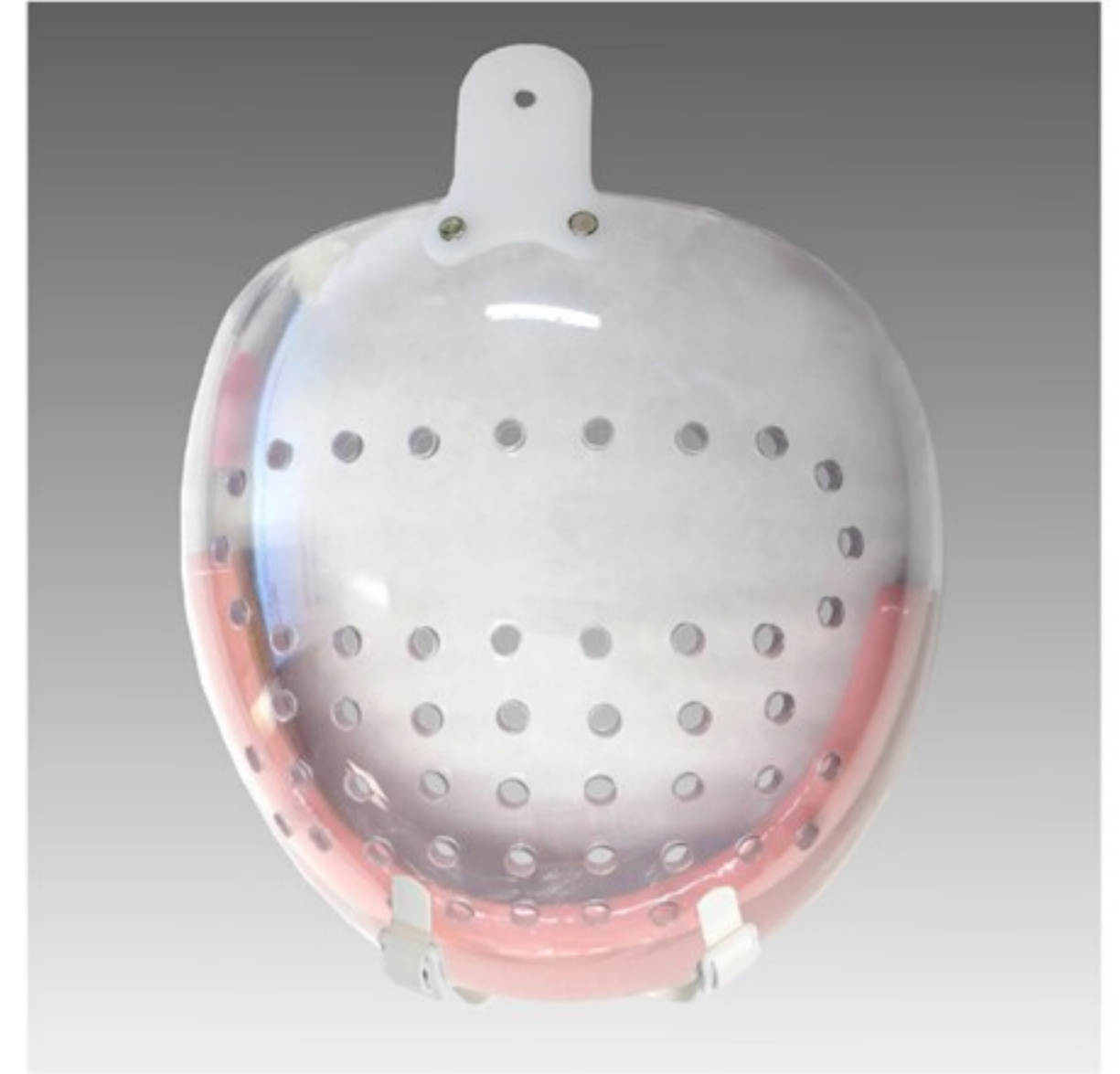
3. Ventilation holes around solid eye area, ventilation holes in mouth and nose areas.