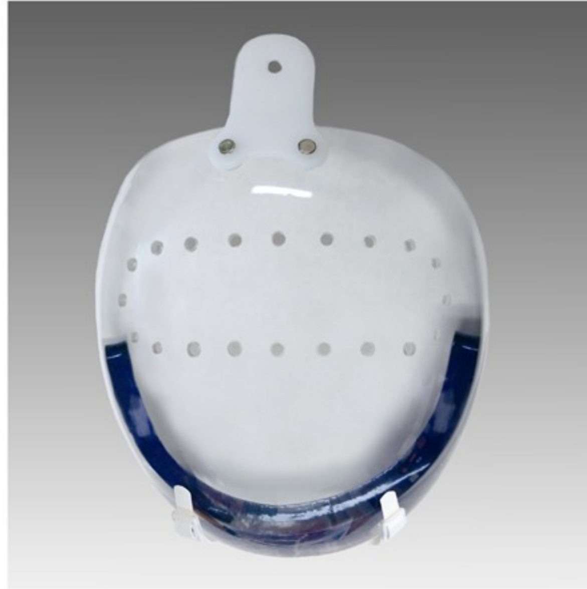
2. Ventilation holes around solid eye area, with solid mouth area.