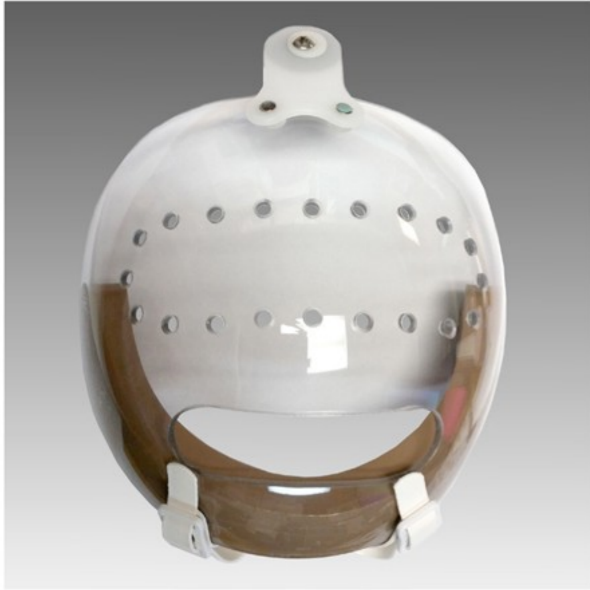
1. Ventilation holes around solid eye area, with standard mouth opening.