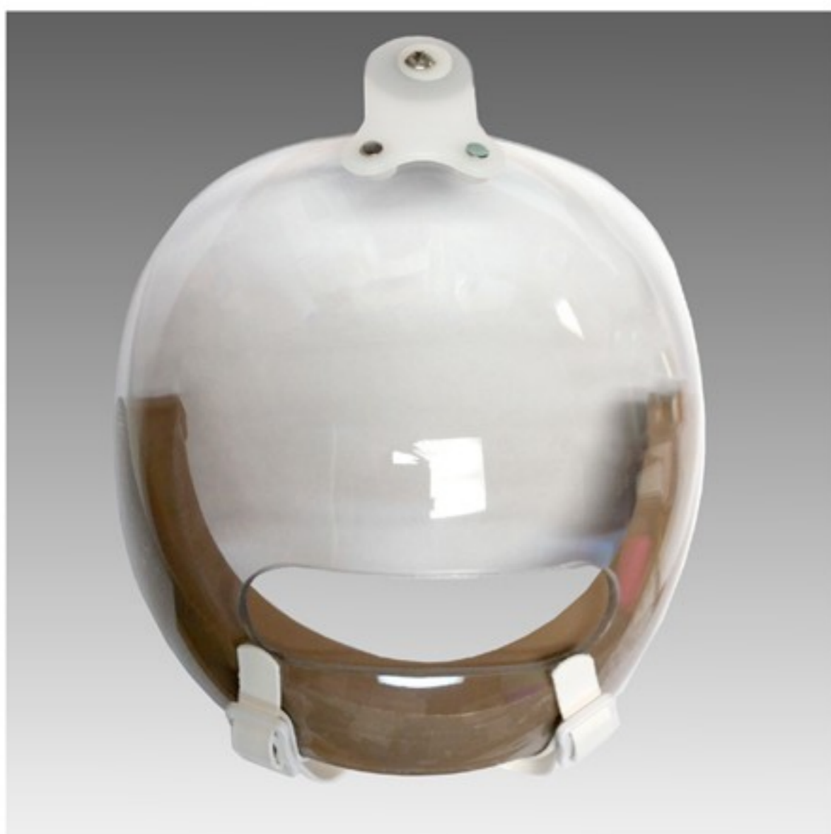
7. Solid eye area with standard mouth opening.