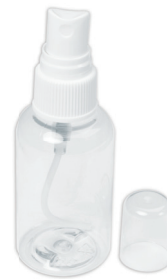
2 oz. Bottle

LF03774U Methyl Cellulose is a nontoxic thickening agent. It can be dissolved with cold water. This will make a paste-like material that can be used to create pus or thickened blood with the Magic Blood Powder or Nasco dye packets (red and blue). Cellulose can be wiped off with paper towel and wash area with soap and water.