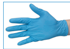
Pair of Gloves