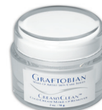
Cold Cream Makeup Remover