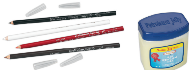
Liner Pencils, 7½" L (White, Black, Red, Medium Brown)

Petroleum Jelly is a paraffin type material used to smooth areas on the skin. Makeup can be added to the jelly to create a rash, add toilet paper to create a burn. Petroleum jelly is nontoxic.