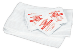
Disposable Towel & Alcohol Wipes