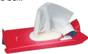
Disposable Moist Towelettes