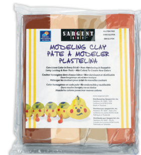
Modeling Clay Set/4