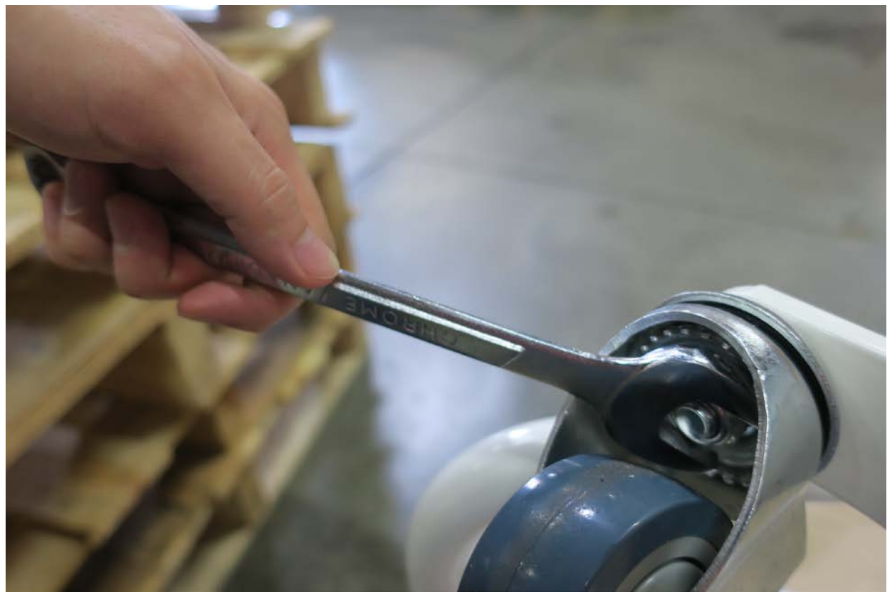
Slowly lay the lift on its other side and repeat for the other caster